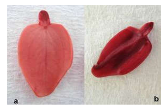
Figure 2. Embryo of canafistula seeds (Cassia grandisL.f) treated with solution of tetrazolium showing the viable tissues with pink coloration (A) and tissues with deterioration with red-camine coloration (B)