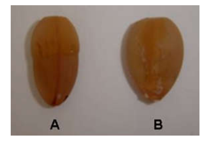
Figure 1. Canafistula seeds (Cassia grandisL.f.) after the preconditioning: imbibition in paper (A) and imbibition with immersion (B)

Was verified yet, that the coloration more uniform and coherent with the recommendation of (Moore, 1972) was obtained when seeds were immersed in tetrazolium solution of 0,5% per 8 hours at 30°C in dark. The most vigorous tissues, were colored for brilliant pink (Figure 2a), while, the tissues with same deterioration or with damages presented the coloration red carmine intense (Figure 2b). The use of tetrazolium solution of 1% did not show to be the most adequate to the evaluation of viability of seeds, once the viable tissues, instead of pink, presented with red coloration, a little less intense than the tonality of red observed in tissues with damages, what difficult the observation of the damages presented in seeds, especially in vital regions of the embryo (Figure 3). In seeds, the vital area includes the hypocotylradicle axis and the region of insertion between the cotyledon and the axis.