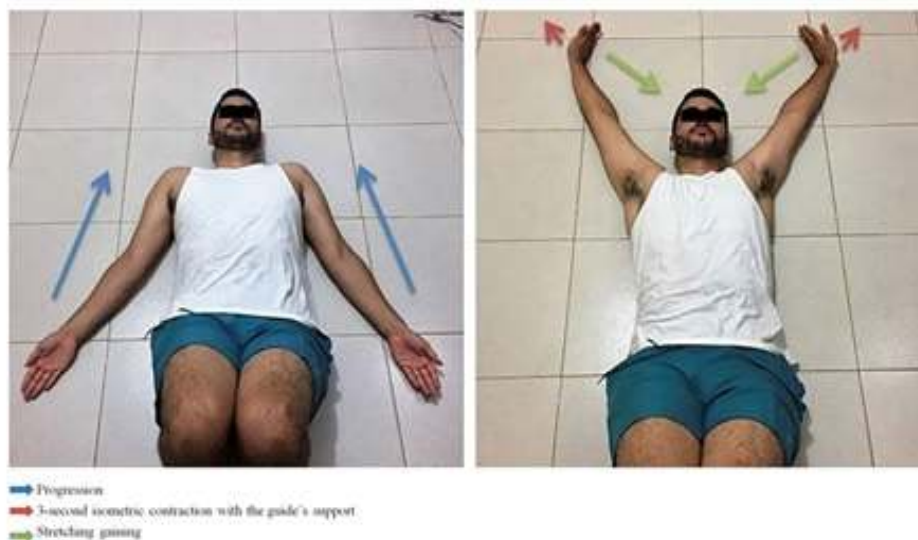
Figure 3. “lying on back with arms open” self-posture

In order to perform this self-posture, initially the individual was positioned in dorsal decubitus position, arms outstretched and distant at 45° from the body, supporting the most of the lumbar region on the floor, knees flexed and feet support on the floor (Grau, 2003). With deep exhalation of the upper part of the chest, gradually the individual was abducting one's own arms to reach the angle of 90°, where he placed the palm of his hand toward the ground, without compensation of the shoulder and/or elbow rotation. He performed an extension of wrist and fingers, executed three small eccentric contractions, lasting three seconds each against resistance imposed by the guide duly enabled. At the end of the last contraction, it was possible to insist on amplitude gaining through the inverse myotatic reflex (Grau, 2003; Soucard, 2012).